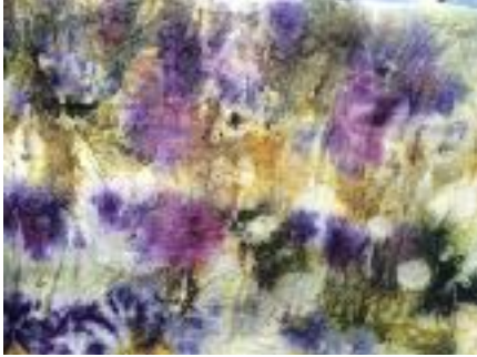
Eco Print #2